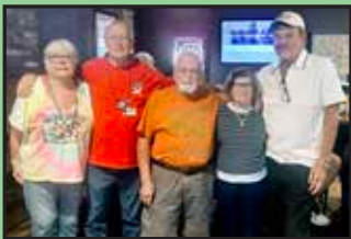
fifty-three (53) Parrot Heads at the meeting.

Our May meeting was at Rooski's Sports Bar. We had another record crowd. Our phlock managed to eat them out of tacos, nachos, and wings. Why do they never believe us when we tell them we will have 50 - 60 people who will want to EAT and DRINK? According to the sign-in sheet, we had