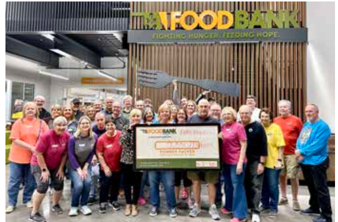
Great job TPHC!