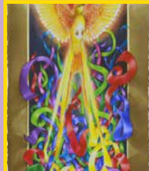
Mayfest Poster 2019

Mayfest has something to offer everyone. The outdoor areas of Mayfest includes fine arts, crafts, four stages of performing artists, KidZone – a children's hands-on