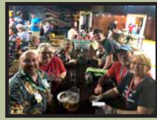
Phlock of Parrot Heads

We held our April meeting at the American Legion Post 1 Tulsa. It was great to meet several new members, nice to see and visit with some returning members who had not been at a meeting for a while, and then we always enjoy hanging-out with our regular members who support the very foundation of our club and its activities. We totaled sixty-five Parrot Heads at our phlocking this month.