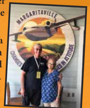
The evening music was on the LandShark Stage