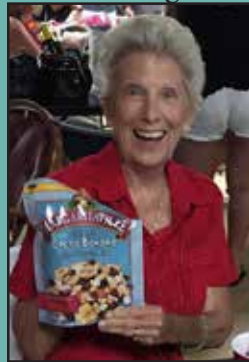
Raffle Prize Winner

August is our club's biggest Birthday month and there was no shortage of birthday hugs being distributed to those parrot heads with Birthdays who attended the meeting.