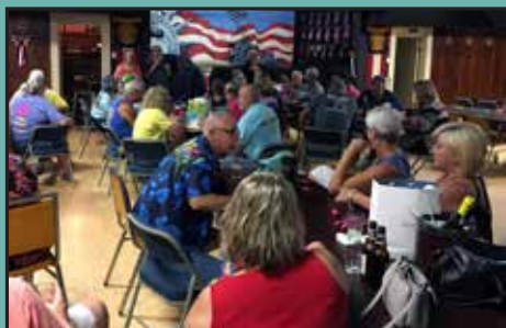
Raffle Fun at the American Legion

The Raffle went off without a hitch and some well deserving participants received very nice donated gifts. Good food, good music, good friends and no drama - all in all a pretty darn good Phlocking. Hope to see y'all in September!